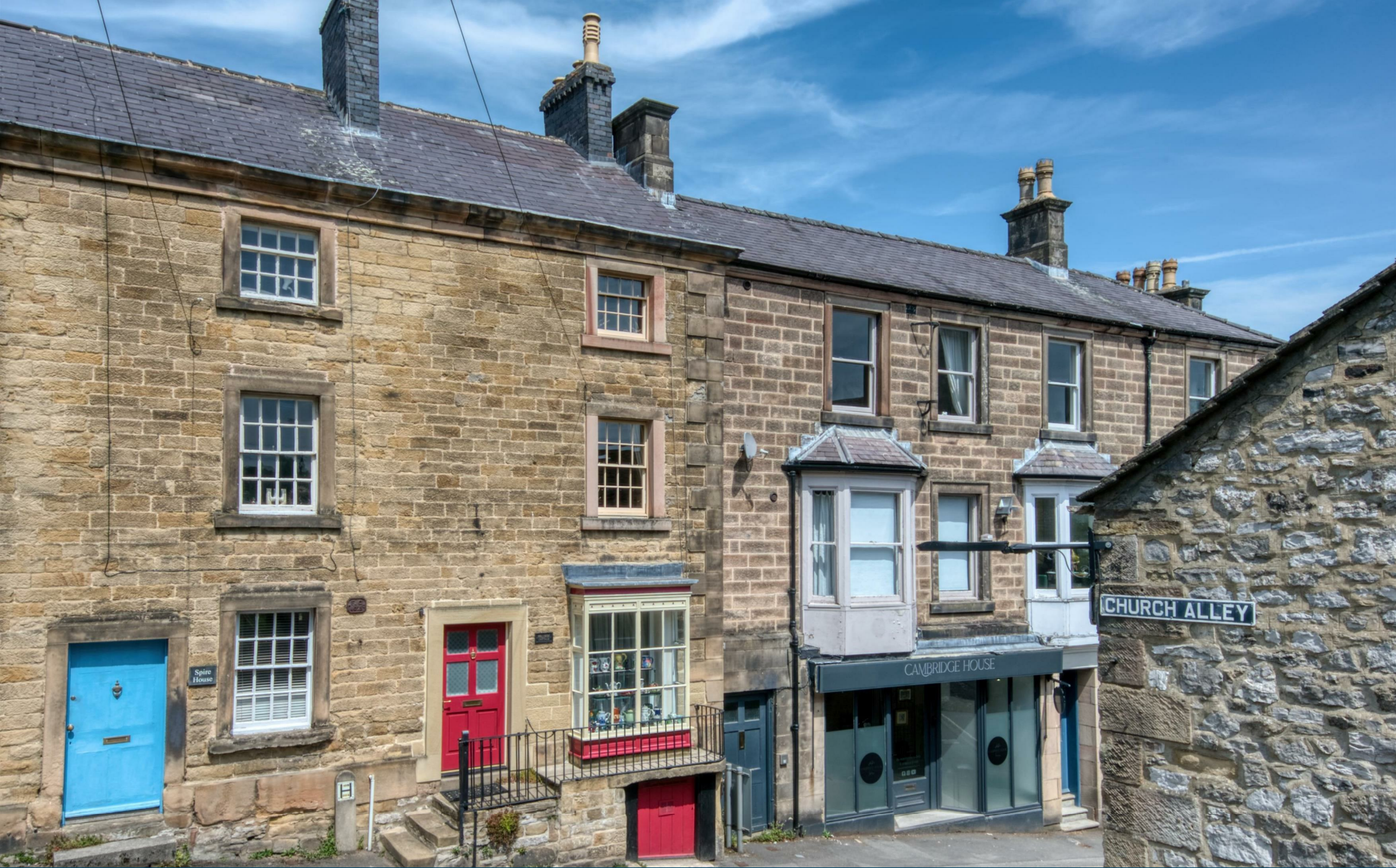
Hillside Cottage North Church Street, Bakewell, DE45 1DB